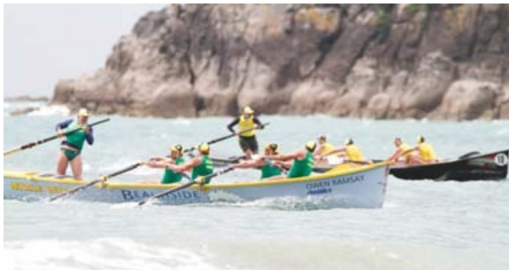
Whale Beach Open boat crew and in the background the Dee Why U23 boat crew taken Round 1 of the DHL International Surf Challenge in NZ Jan 31, 2011

newest and youngest members. Congratulations to these Australian Representatives.